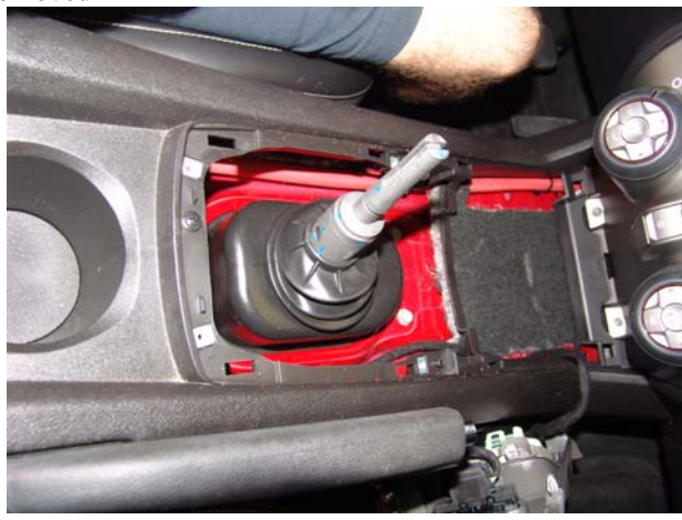
Figure 4: shifter boot removed

Now you will need to access the bottom side of the car to remove the shift linkage from the transmission. First part you need to find the shifter box which is located just aft of the transmission and above the first driveshaft connection. You will see a black rubber boot covering the assembly. This will need to be pulled down and free so you can unhook the rod from the lever. The boot will stay on the car as it is wrapped around the rod going to the transmission. See figures 5a and 5b for this location and boot removal.