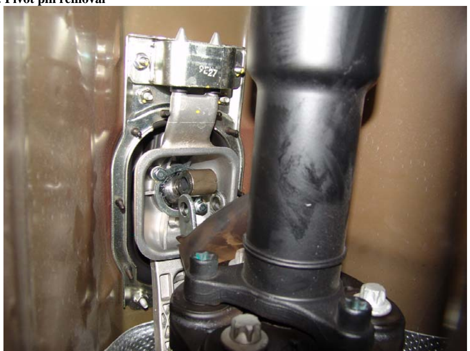
Figure 8: Shifter bolt removal