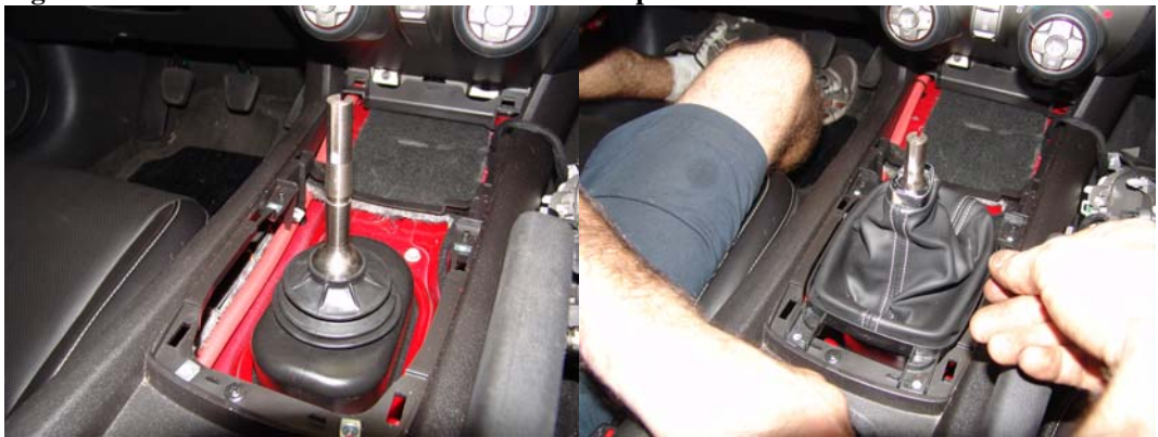
Figure 12a and 12b: New shifter install and boot replacement

Now you are ready to install the shifter back into the car. Install is going to be basically the reverse of your removal. Start by installing the shifter from the bottom side of the car, and replacing the two screws removed on the plate. Line up the shift rod and re-install the shift level pin and clips. Once this is done, pull the dust boot back up and over the shifter box assembly and you can enter the inside of the car to finish up the boot and trim panel install and top off with your shift knob!