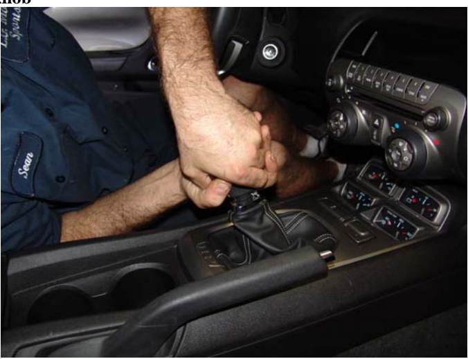
Figure 1: removing knob

Once the shift knob has been removed you can now remove the lower shifter trim plate from the car. Again this piece is held in with small GM clips. You may find it easier to use a small flat blade screw driver, or clip removal tool. See figures 2a and 2b.