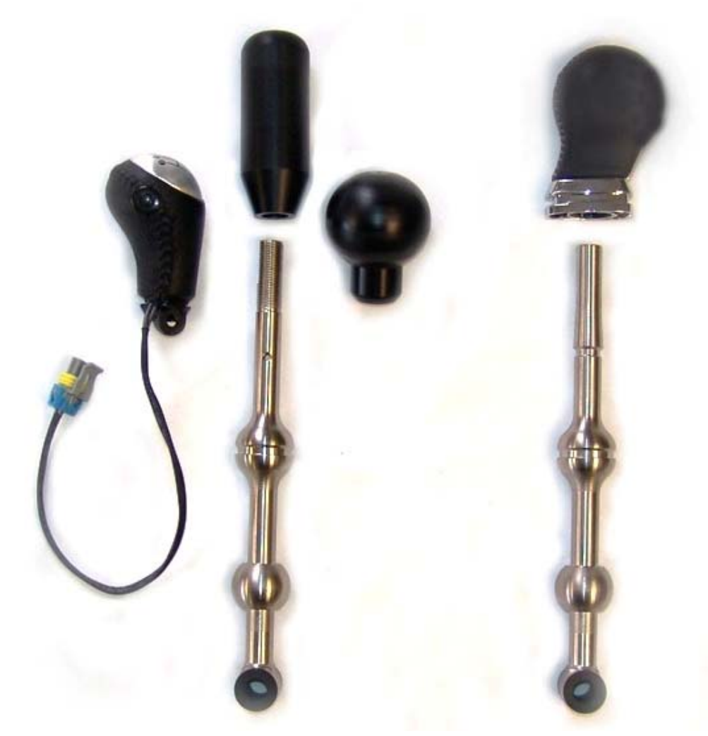
Thank you for purchasing LGM's short throw shifter for your Camaro

"THE MOST POWERFUL HEADERS ON THE PLANET" Brought to you by LG Motorsports 972-429-1963