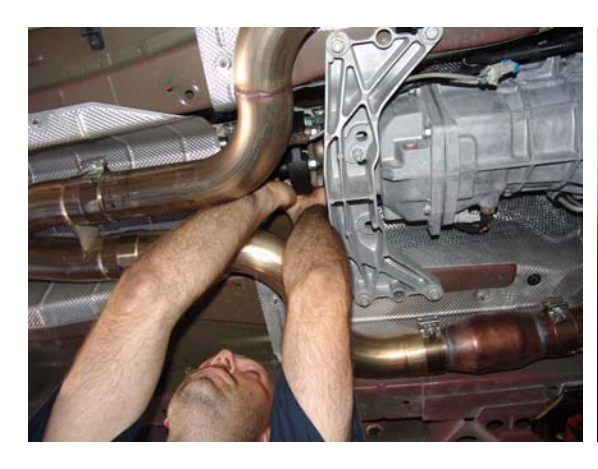
Figure 5a and 5b: removing dust boot and pivot rod