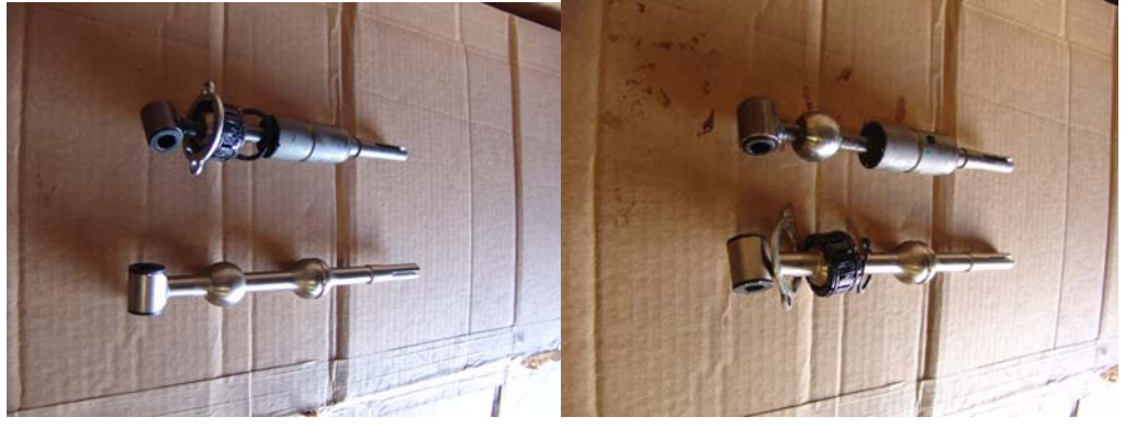
Figure 11: Stock and LG shifter side by side.

Now that the stock shifter has been removed you will need to start by transferring over the pivot point, seal, and retaining plate to the new shifter. These simply side off with a little push on the plastic bearing. Please note the line up before removing. You may want to apply a little bit of grease to the ball prior to assembly for smooth action.