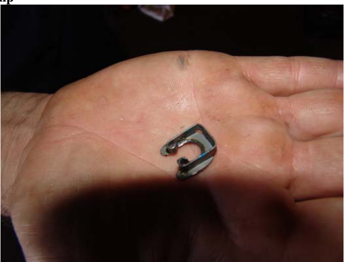
Figure 6: Pivot rod clip

Now that the boot is removed you will need to remove one of the two clips holding the pivot pin in place. This can be done with a long flat screw driver, or your fingers. Once this is out, slide the rod out and the shift lever is now free. This is easiest to remove with the transmission in N. There are now just two 10mm head screws holding the shift lever in place. You will need a 10mm socket, swivel and extension to reach this. Make sure not to lose the screws when they come out. The lever will now come out through the bottom of the car. You may want to push down from the top side to un-seat the pivot bearing. See Figures 6 through 10 below for details.