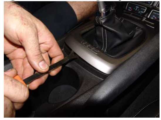
Figures 2a and 2b: removing trim panel

Once the shift knob has been removed you can now remove the lower shifter trim plate from the car. Again this piece is held in with small GM clips. You may find it easier to use a small flat blade screw driver, or clip removal tool. See figures 2a and 2b.